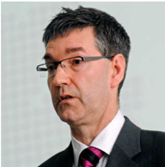
Ian Gilzean Chief Architect, Scottish Government